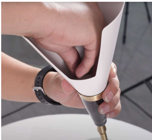
2.Install the bulb and lampshade