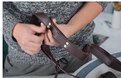
4. Tighten the screws to secure the belt