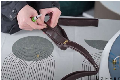
1. Loosen the screw