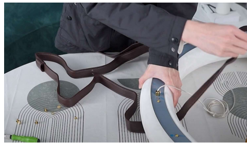
2. Thread the belt through the lamp body